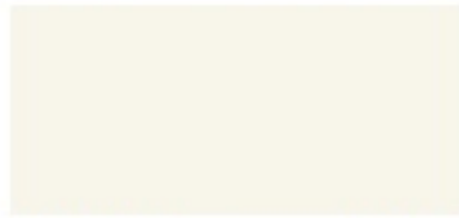
BONE WHITE SR.66