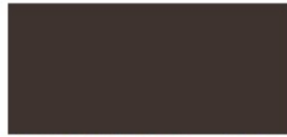
MANSARD BROWN SR.27