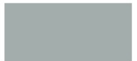
DOVE GRAY SR.31