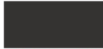
DARK BRONZE SR.29