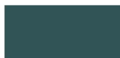
TEAL BLUE SR.29