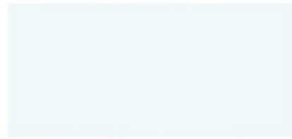
REGAL WHITE SR.65