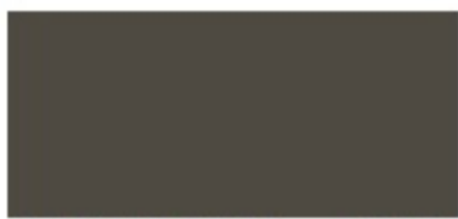
MEDIUM BRONZE SR.30