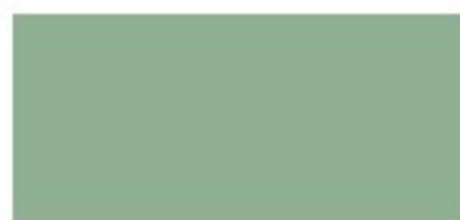
AGED COPPER SR.45