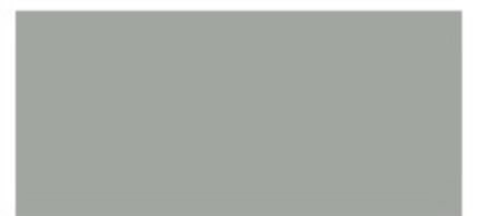
BRIGHT SILVER SR.53 premium