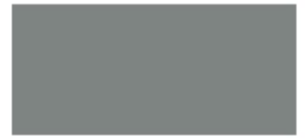
PREWEATHERED GALVALUME® SR.35 premium