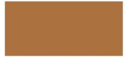
METALLIC COPPER SR.42 premium